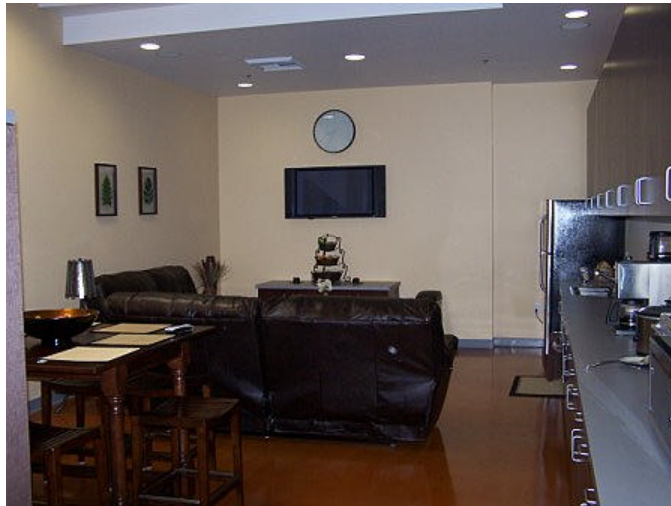
ITS Employee lounge area