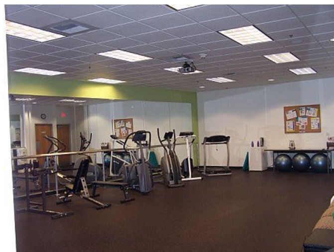
ITS Employee gym