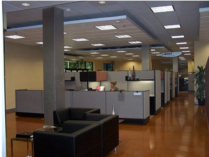
Front Lobby view the of open architecture office environment at ITS' new Corporate Office.