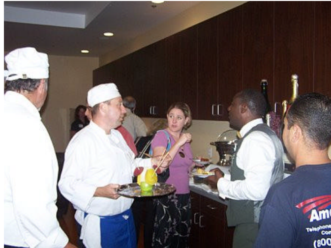
Caterers' serve Open House attendees hors d'oeuvres